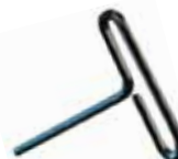
RH85SKT100 Allen Wrench Tool For Set Screws