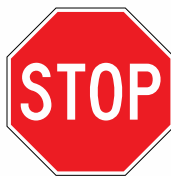
STOP Sign S3030R11HA HIP Sheeting