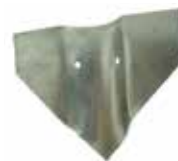
Round Post Anchor Plate BA080APLATE238 (keeps post from rotating)