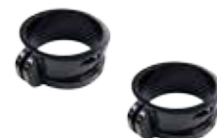
Sign Panel Brackets OSIZ5SPR3BK (2 brackets and black set screws included in package)