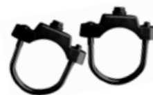
U-Bolt Clamps OTSBR3UBCLAMP3BK (Set of 2 included in package for mounting sign to post)