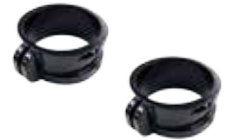
Sign Panel Brackets OSIZ5SPR3BK (2 brackets and black set screws included in package)