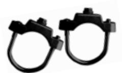
U-Bolt Clamps OTSBZR3UBCLAMP3BK (Set of 2 included in package for mounting sign to post)