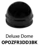
Deluxe Dome OPOZFR3DD3BK