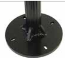
OPOR3ASMWBK Surface Mount Welded Plate