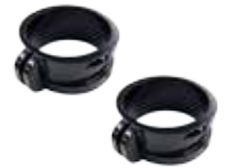
Sign Panel Brackets OSIZ5SPR3BK (2 brackets and black set screws included in package)