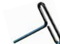
RHBSSKT100 Allen Wrench Tool For Set Screws

Custom Products Corporation • 1-800-367-1492 phone • 1-800-206-3444 fax • www.cpcsigns.com