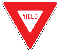
36" YIELD Sign S3636R12HA HIP Sheeting