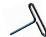
RHBSSKT100 Allen Wrench Tool For Set Screws