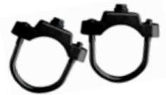
U-Bolt Clamps OTSBR3UBCLAMP3BK (Set of 2 included in package for mounting sign to post)