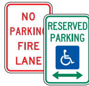
12" x 18" Parking Sign S1218(XXX)HA HIP Sheeting | *Specify Legend