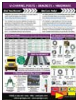
Did You Know? U-Channel Posts, Brackets & Hardware