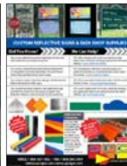
Did You Know? Custom Reflective Signs & Supplies