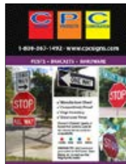
Posts, Brackets & Hardware Product Guide