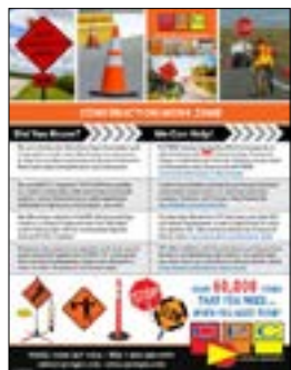
Did You Know? Work Zone

Check out more "Did You Know?" topics and Product Category Guides. Visit our Download Library and Distributors Tabs on the CPC website for even more!