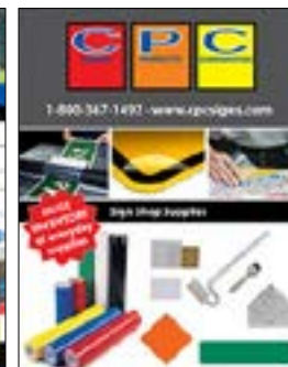
Sign Shop Supply Guide

We Carry OVER 60,000 ITEMS THAT YOU NEED...WHEN YOU NEED THEM!