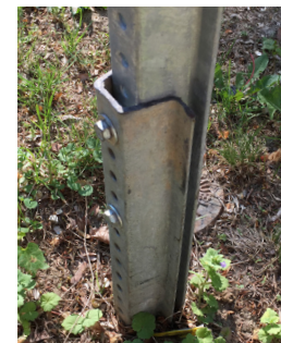
RPOCZSAFETYSPLICE for 1-2 1/2 lb posts RPOCZSAFETYSPLICE3 for 3-4 lb posts

A POZ-LOC® Performance Post anchor can be driven into the ground first, allowing crews to work at ground level for quicker, cost effective installations or replacement of damaged sign posts.