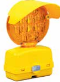
RSPBLBL6YY - Yellow Lens RSPBLBL6RY - Red Lens Type B LED