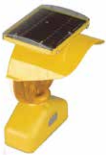
RSPBLBL3YYSA - Yellow Lens RSPBLBL3RYSA - Red Lens Type B Solar LED